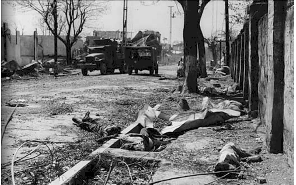
The Japanese would burn a home and kill those who fled the fire

entirely, but always leave an escape route so that the enemy is not forced to fight to the death. Again, the Americans failed to bear this in mind.” Among my responses to this is: even if they were trapped, is that enough to excuse their wanton massacring of civilians? Aside from the fact that many if not most of the egregious massacres occurred before the Japanese were sealed in. And since they had made every building in the city a fortress, it doesn’t seem to me they were planning an exodus. Or do they mean “fight to the death of all civilians ?” This was a fairly rogue concept.