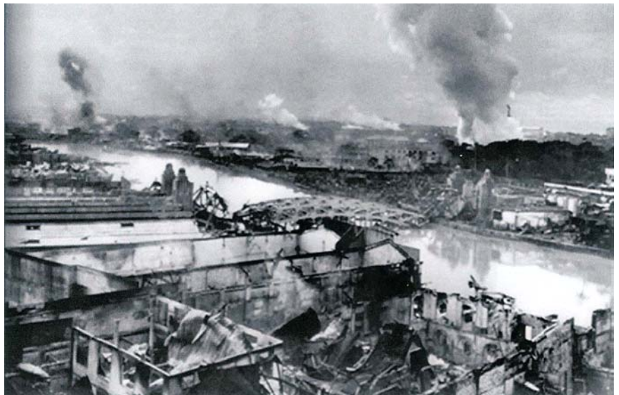
Part of what used to be called “The Pearl of the Orient.”